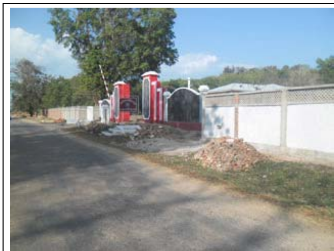
This photo was taken by a KHRG community member in November 2013 in Bu Tho Township, Hpapun District. This photo shows Tatmadaw Light Infantry Battalion (LIB) #434's army base, situated in between Way Hsah and T'Koh Teh villages. According to the KHRG community member, this army base was originally fenced with bamboo and barbed-wire, but in the beginning of 2013, the camp was strengthened and fenced with bricks and cement.

In Bu Tho Township, Hpapun District, villagers reported that while they had seen a reduction in Tatmadaw patrolling and other activities, they have experienced an increased presence of two Border Guard Force (BGF) 7 battalions (#1013 and #1014), who have been active in the area since the ceasefire. Villagers in Bu Tho Township have raised numerous concerns regarding the BGF's soldiers and officers from these two battalions, as they have committed multiple human rights violations, including the violent abuse of villagers, as well as threatening, demanding taxation and forced labour. 8