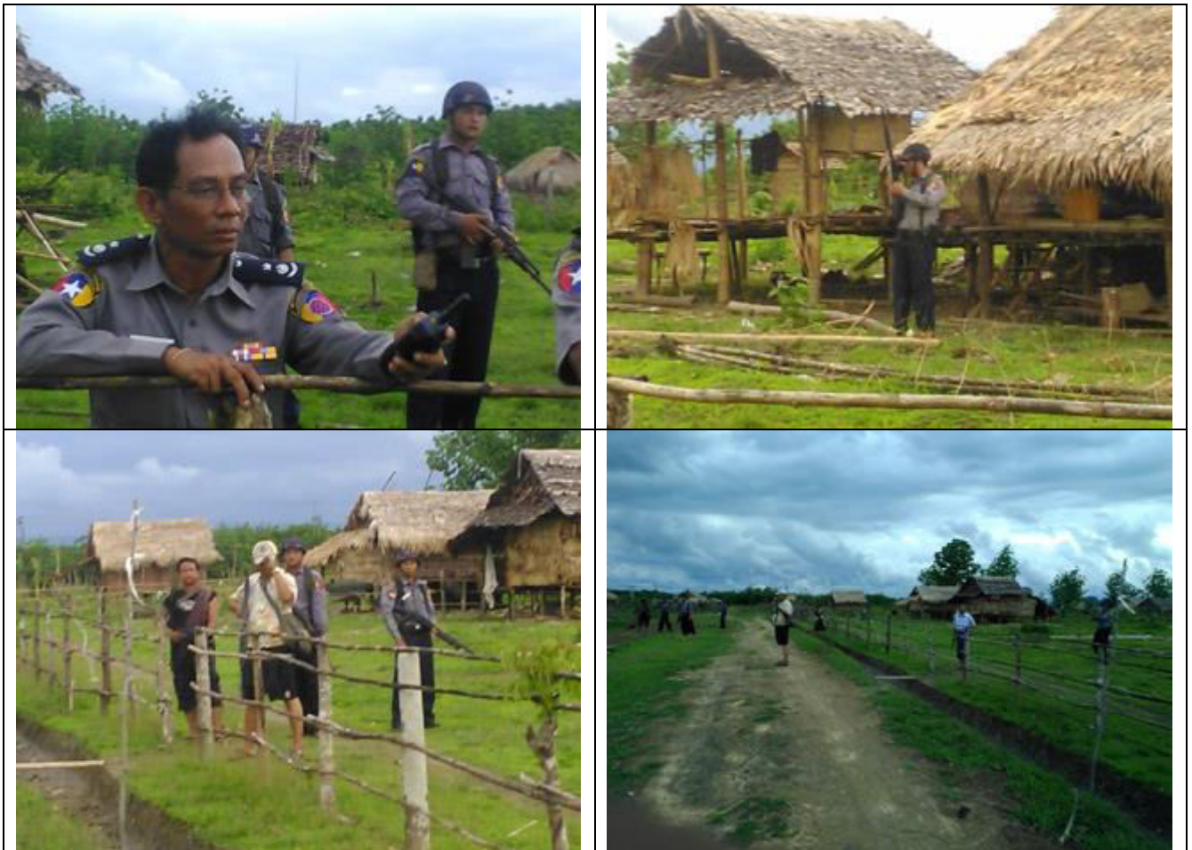
These photos were taken by B--- villager on June 9 th 2015, in B--- village, Kaw Yin A Htet village tract, Hpa-an Township, Thaton District. The photos show the Burma/Myanmar police force who came to B--- village on June 9 th 2015 and ordered villagers to dismantle their houses and leave the place permanently. According to the villagers, prior to the June 9 th incident, between March and June 2015, the Burma/Myanmar government police force and the local Burma/Myanmar government authorities had come to B--- village on five different occasions during which they arrested villagers and took villagers' belongings.