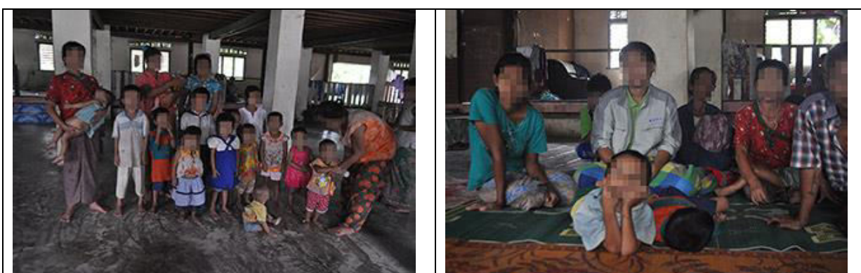
These photos were taken in Myawaddy, Kawkaik Township, in Dooplaya District on July 8 th 2015. They some of the villagers who fled to Myawaddy after Burma/Myanmar government officials and police came and burnt down their houses on June 22 nd 2015.

They are missing school for this year. If we can go back to our village, they will be able to continue their schooling. If we cannot go back, they will not. They have been attending their school for only two or three weeks [this year] before the conflict started. Since the conflict started, they were not able to go to school.