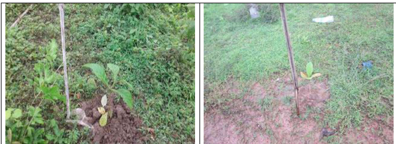
These photos were taken by a B--- villager on June 26 th 2015, in B--- village, Kaw Yin A Htet village tract, Hpa-an Township, Thaton District. The photos show young teak trees, which were planted by officials from the Burma/Myanmar Department of Forest Management when they destroyed and burnt down villagers' houses between June 22 nd and June 25 th 2015.