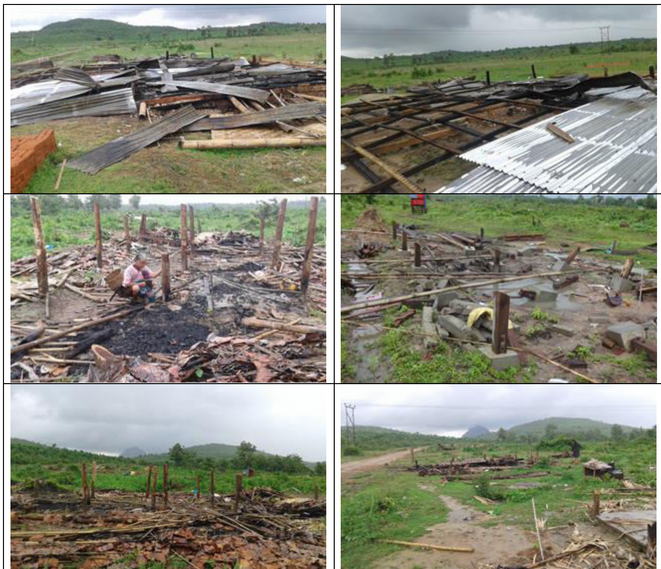
These photos were taken by a B--- villager on June 26 th 2015, in B--- village, Kaw Yin A Htet village tract, Hpa-an Township, Thaton District. The photos show the remnants of the village, which was destroyed and burnt by the Burma/Myanmar police force and officials from the Burma/Myanmar Department of Forest Management between June 22 nd and June 25 th 2015. According to the B--- villagers, 97 houses were burnt down within four days, in addition to the 78 houses the villagers destroyed on their own, totaling 175 destroyed houses and displacing approximately 500 villagers.

They took the zinc, finished timbers [that formed part of my house] and stilts that were still in good [condition after they had destroyed my house]. They took all of the valuable things. They left only the things which are not valuable and they kept them [the non-valuables] beside the road and the other villagers came and took them [for themselves]. I did not go and take any of it as I did not want it anymore. What I want [from the police] now is to get back our land. Please try [advocating] for us until we get back our lands. We have our land grants [that were] produced by the KNU, but they [the police still] did this to us. Therefore, we ask teacher [Saw P---] to help and he said that there are some people [NGOs] who are going to help us [to get back our lands]. I do not know any other people [organisation]. I have never been here in Myawaddy. This is my first time coming here.