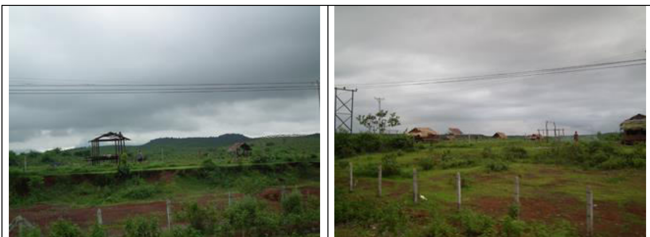
These photos were taken by a KHRG member on July 6 th 2015, in Shwe Ni area, Kaw Yin A Htet village tract, Hpa-an Township, Thaton District. The photos show the 20.8 acres of land which the Burma/Myanmar government provided to landless people in Kaw Yin A Htet village tract. The villagers who built the houses on this land are people who won the draw for the land which was organised by Burma/Myanmar government officials. B--- villagers were offered to enter this draw, but refused due to this area being far away from their village and their connection to their ancestral land in B---.

I mean those who burnt down our houses. Please help us make them arrange places of residence for us. We want to go back and live on our land. We were asked to go live beside Shwe Wa Htun road [Shwe Ni area, Kaw Yin A Htet village tract] and we were asked to draw lots [for plots of land there]. We do not want to draw lots because we do not want to go live there. I do not own any land [in C--- village]. If you do not believe me, you can check my name in the Hpa-an [Township] office. I am not lying. My husband also had asked me to go and live in his village [in Bilin Township] but I did not want to go live in his village. I have been living in my village [B---] for 44 years. I was born in my village and I am also going to die in my village. Therefore, I do not want to go live in other people's village.