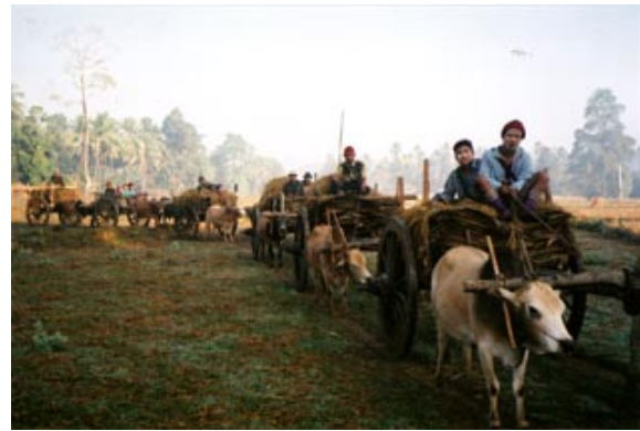
The same villagers transport 3,000 shingles of thatch on seven bullock carts to the DKBA camp at K'Dter Dtee (Ka Dtaing Dtee), over 11 kilometres (7 miles) away.

"DKBA and SPDC soldiers stay in my village all the time. If they give orders to go somewhere, we must go at once. If we do not go, they torture us... The village head must do [forced labour] and go first when they give an order to go somewhere. We have to do 'loh ah pay' [forced labour] 3 all the time, such as carry loads to the villages of Meh Ku Kee, Meh Nay Hta, and Twee Thi Oo."