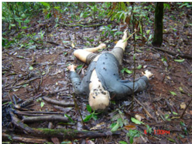
The body of a convict porter killed and left behind by SPDC troops from MOC #15 while operating around Dta Paw Der and Dta Meh Der villages in the Bilin River area, Lu Thaw township in June 2006.

The SPDC offensive is also continuing south of the Kyauk Kyi – Saw Hta vehicle road in Yeh Mu Plaw village tract. MOC #10 has established another new camp on a hill called Thay Wah Kyo (or Hill 3474), near Bpee Thu Der and Yeh Mu Plaw villages (see map). Between July 15 th and 22 nd , Light Infantry Battalions #368 and 369 have been actively destroying villagers' houses, farmfield huts and rice storage barns in the area. At time of writing KHRG has not yet obtained detailed information on the extent of the damage, because all villagers in the Bpee Thu Der and Yeh Mu Plaw areas have fled into the surrounding forests and have not yet been able to return to assess what has been destroyed. As in the case north of the vehicle road, the establishment of the new Army camp makes it unlikely that they will be able to return to their fields in the near future and this year's crop will almost certainly be lost.