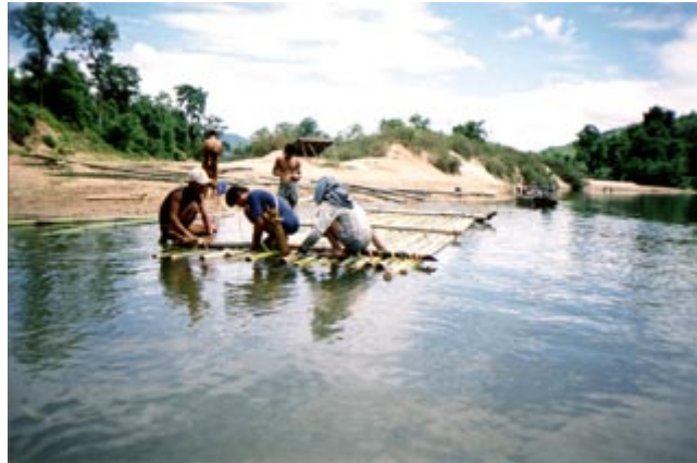
Villagers from K---, Dweh Loh township construct a raft to transport bamboo down the Bilin River to the SPDC Infantry Battalion #30 camp at Wa Mu in May 2006 upon demand by the troops based there.

In January, DKBA non-commissioned officer (NCO) 4 Pu Plah demanded 500 shingles of thatch for himself and 500 shingles of thatch for his camp from Ler Kheh Khaw village in Bu Tho township. He also demanded thatch from six other villages. A villager from T---, Bu Tho township reported that on January 18 th , DKBA NCOs Pah Mya and Tun Kyaing demanded 1,000 shingles of thatch and 500 pieces of bamboo for the construction of their camp. The DKBA demanded 500 shingles without compensation and paid only 12,500 Kyat for the rest, which was below the market value. Villages staying near to the location of the intended camp were also forced to work on its construction. On one occasion in February and again on March 14 th , Commander Aye Chan Tha Yan from SPDC Light Infantry Battalion #341 sent a letter to the head of Klaw Day village, Bu Tho township demanding thatch (150 shingles in the first instance and 300 in the second). The villagers were forced to carry the thatch to T' Kun Htaing, which was one hour away by foot.