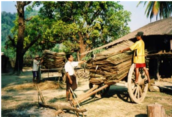
Villagers from H---, Htee Th'Blu Hta village tract, Dweh Loh Township load thatch onto bullock carts as ordered by K'Saw Wah battalion of DKBA Brigade #777 in March 2006. They were also ordered to pay 100,000 kyat.

For villagers living in SPDC- and DKBA-controlled areas of Papun District, forced labour is a pervasive abuse. Indeed, the systematic perpetration of forced labour functions as an integral component of the militarisation of Karen territory, inseparable from the structures of military rule. The incidents of forced labour reported here have occurred in areas of military control away from the current SPDC offensive. In towns near army camps or along roadways villagers have been forced to porter rations and building supplies to military camps, serve as guides, construct military structures and fences, clear brush from the sides of roads and work on military plantations previously confiscated from the villagers themselves. This labour is compulsory under threats of torture and arrest for both men and women.