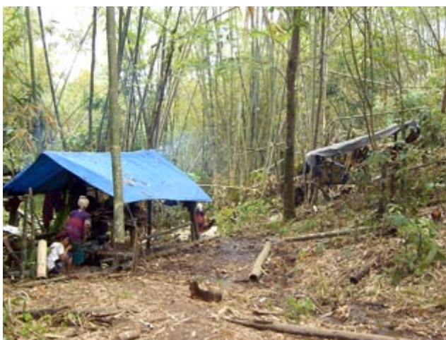
Displaced villagers in Lu Thaw township construct temporary shelters after SPDC soldiers attacked and burned down their homes.

The SPDC military offensive throughout northern Karen State and covering parts of Lu Thaw township in northern Papun District is aimed at consolidating SPDC control over Karen territory. As such, the SPDC targets villages resistant to military demands instead of KNLA forces that are more difficult to overcome. All civilians living beyond the direct and easy reach of the Army are ordered and physically forced to move to villages and relocation sites which are easily accessed from SPDC bases. However, many villagers, aware of the prevalence of abuse in military-controlled areas and unwilling to give up their land, choose to evade the SPDC's operations by fleeing into the forest near their villages and fields. In these situations the SPDC perceives displaced villagers as a threat to the consolidation of military control and works to destroy their ability to sustain an adequate livelihood while living in the forest. All attempts are made to force villagers out of the forest and into SPDC-controlled areas. Food supplies and fields are destroyed; displaced villagers are shot on sight; and the military works to sever all contact and trade between villagers in hiding and those under SPDC control.