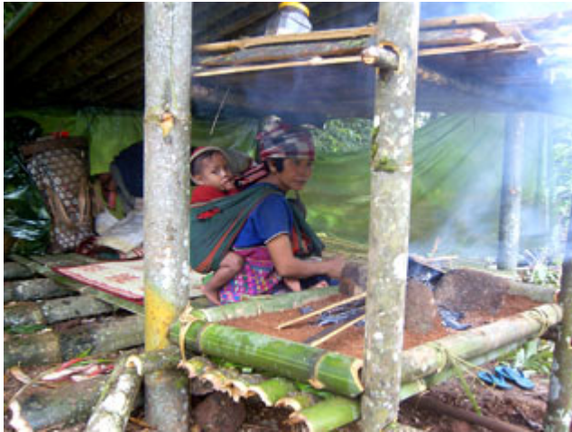
A displaced villager in Lu Thaw township cooks underneath a temporary shelter following SPDC soldiers' destruction of her home.

So long as SPDC troops remain in the area, displaced villagers wait in the forest, monitoring the movements of the military. They return to their villages and hidden storage barns to retrieve food supplies or to work their fields, sometimes by night or with KNLA escorts for security. Food security in such circumstances is precarious and displaced villagers are restricted to either trading at clandestine jungle markets set up for this purpose; covertly venturing into towns or larger villages; or meeting local villagers just outside of their village proper in order to obtain supplies.