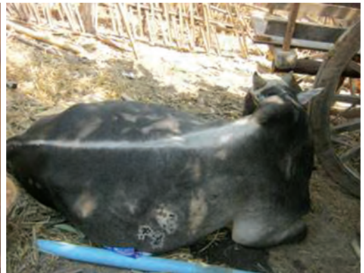
The above photos were taken on May 10 th 2016, in C--- village, Mone Township, Nyaunglebin District/east Bago Region. The photos show Maung A--- and his cow who were injured by landmine shrapnel when Saw A--- went to collect firewood beside his land compound. 49