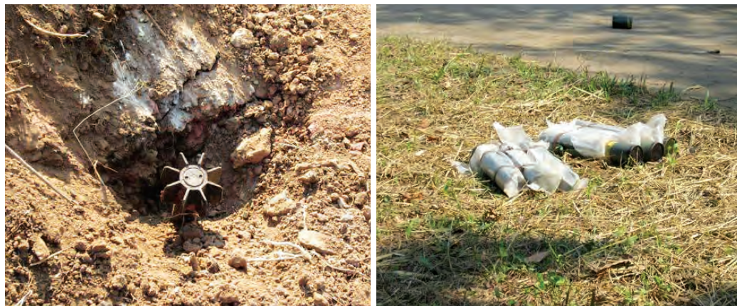
These photos were taken on January 19 th 2015 in Win Yay Township, Dooplaya District/south Kayin State. The first photo shows an unexploded rocket that was carelessly left after the Tatmadaw military training exercise. In total seven rockets were seen, some of which were fired, some of which were not. The second photo shows the shells in their packaging which were left by LIB #310 near U M---'s farm. A villager said that it is not the first time that they have left shells in their packaging. 40

Another military training was reported in and near P'Soh Oo and P'Nweh Hpoh Kloh villages in Ler Muh Lah Township, Mergui-Tavoy District. It was reported to KHRG that the training lasted for three months from November 2015 until January 2016. It included patrols through the named villages. 39 Apart from these target trainings being dangerous for the villagers and damaging their crops during the time they are conducted, they are also dangerous afterwards because unexploded ordnance and packaged shells are left behind on the villagers' lands.