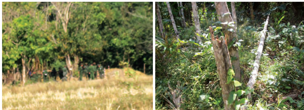
These photos were taken on January 19 th 2015 in Win Yay Township, Dooplaya District/south Kayin State. The first photo shows LIB #310 engaging in heavy weapons target training. The second photo shows a farmer's durian and betel nut trees which were hit by shrapnel from previous heavy weapons target practice in 2014 by LIB #310. These photos form part of a larger published photo set. 38

Another military training was reported in and near P'Soh Oo and P'Nweh Hpoh Kloh villages in Ler Muh Lah Township, Mergui-Tavoy District. It was reported to KHRG that the training lasted for three months from November 2015 until January 2016. It included patrols through the named villages. 39 Apart from these target trainings being dangerous for the villagers and damaging their crops during the time they are conducted, they are also dangerous afterwards because unexploded ordnance and packaged shells are left behind on the villagers' lands.