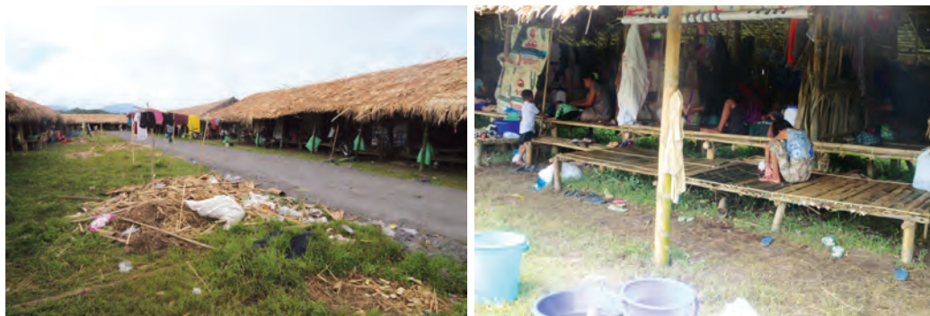
These photos were taken on October 6 th 2016 by a KHRG community member in an Internally Displaced Persons (IDP) camp in Myaing Gyi Ngu area, Hpa-an District/central Kayin State. It shows the villagers that were displaced due to the recent clashes in Meh Th'Waw area, Hlaingbwe Township, Hpa-an District/central Kayin State. 94

The militarisation, land confiscations, armed clashes and resulting displacement have negative consequences for the villagers' livelihoods. They were left without their farms and plantations and therefore without their main means of subsistence and/or income, forcing them to work as day labourers in order to support themselves and their families.