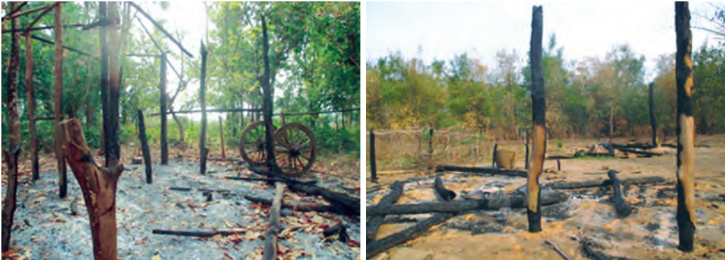
These photos were taken by a KHRG community member in March 2016 in Tha Nay Moo village, Kawkaareik Township, Dooplaya District/south Kayin State and show houses burned down by the Tatmadaw and BGF. Reportedly villagers were able to return to their village only after March 2016. 64

There was also fighting between the KNU/KNLA and Tatmadaw in Hpapun District, near the Hatgyi Dam site, on September 30 th 2015 as a result of members of the Tatmadaw entering KNU/KNLA territory, resulting in the torture of one villager by the Tatmadaw and the flight of approximately 10 families to the surrounding Myaing Gyi Nyu Town, Hpa-an District, for safety. 62 More clashes took place between the Tatmadaw, BGF and the DKBA (Buddhist) in January 2016 in Tha Nay Moo village. During that time 16 houses were burned down by the Tatmadaw and BGF. 63