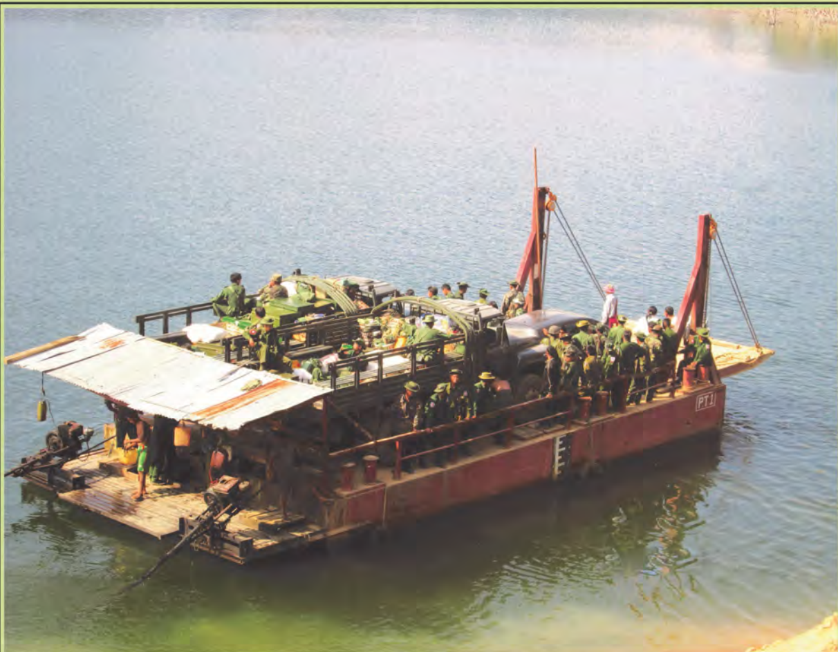
This photo was taken by a KHRG community member on December 16 th 2015, near Hkler La village, at a location known as P'Leh Wah, in Htantabin Township, Toungoo District/east Bago Region. It shows Tatmadaw soldiers crossing a river with rations and troops.

"The villagers reported to me that they [Tatmadaw] have the unusual activity after the ceasefire as they send more rations. Although we do not encounter with them, we looked from [far] away and saw that they sent more of their rations and ammunition. Therefore, the villages dare not go back [to their village] to work [on their fields]. [...] There is no activity like patrolling and burning [houses] like they did before. There is activity like sending their rations and ammunition. [...] The opinion of the villagers is that although there is the ceasefire, it is not a genuine ceasefire so the villagers do not go back to live in their village."